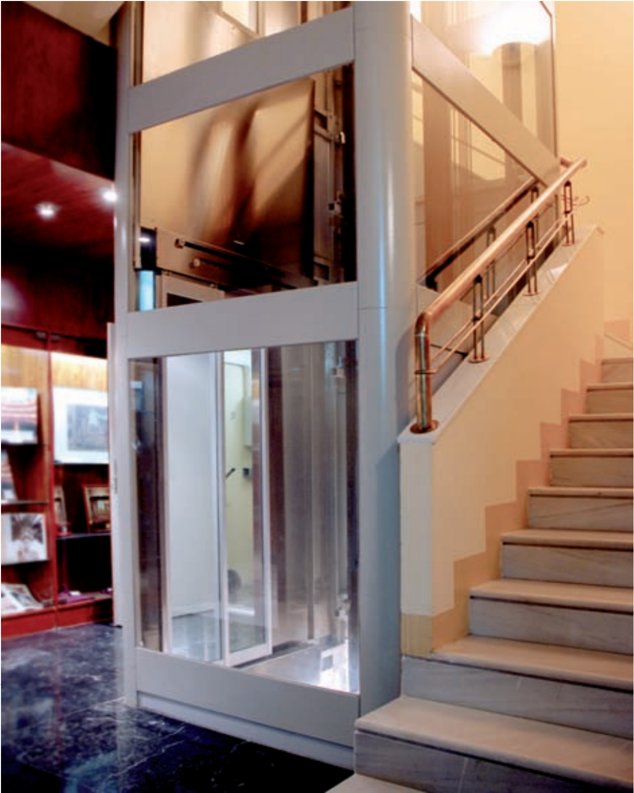
MP STRUCTURA Fortuny Theatre Tarragona. Spain.